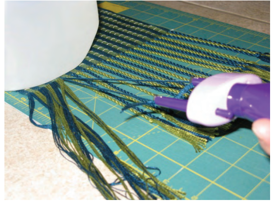
After Step 3