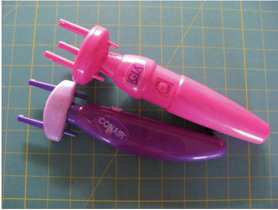
Two strand and three strand fringe twisters.