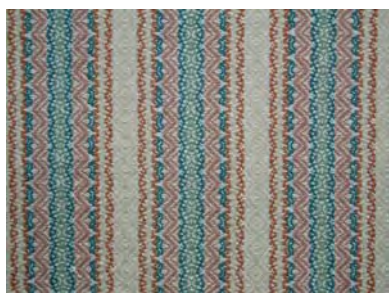
Left: Close up of the towel.

Multiple Tabby Weave is a weave system of several threading blocks each of which has its own tabby. There is no "true" tabby or plain weave in this pattern.